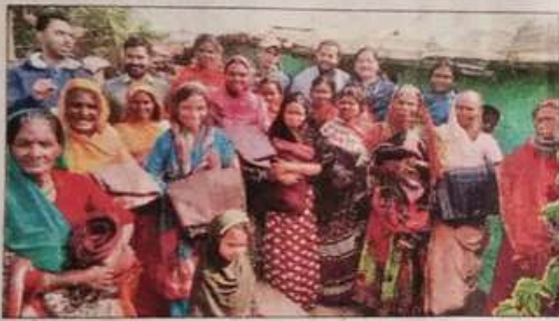
कटारी हिल पर गरीबों को कंबल मिलते ही चेहरे खिले।

गया, वरीय संवाददाता। गया में बढ़ रही ठंडी में समाजसेवी आजकल गरीबों की ठंड मिटा रहे हैं। पिछले दस दिनों में बढ़ती ठंड को देखते हुए कंबल गरीबों जरूरतमंदों को बांटे गए हैं। यह काम शहर से लेकर गांवों तक चल रहा है। इसी क्रम में रविवार को ग्लैड भारत फाउंडेशन ने गया के कटारी हिल और गेवलबोधा पुलिस लाइन की बस्तियों में कंबल का वितरण किया।