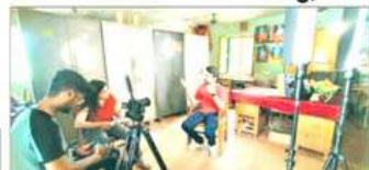
डॉक्यूमेंट्री बनाने की दौरान शूट करती जोश टॉक की टीम।